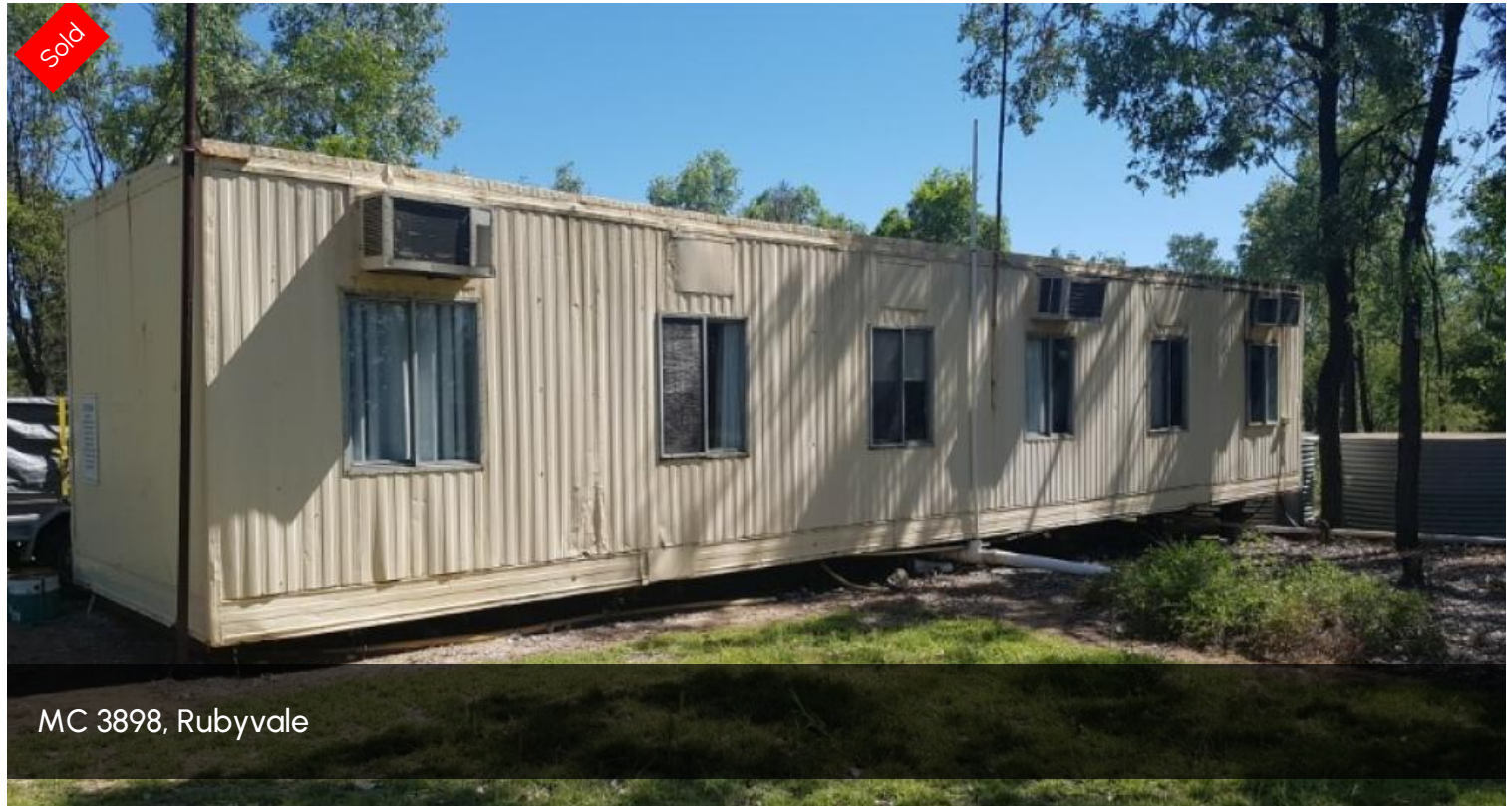
MC 3898, Rubyvale