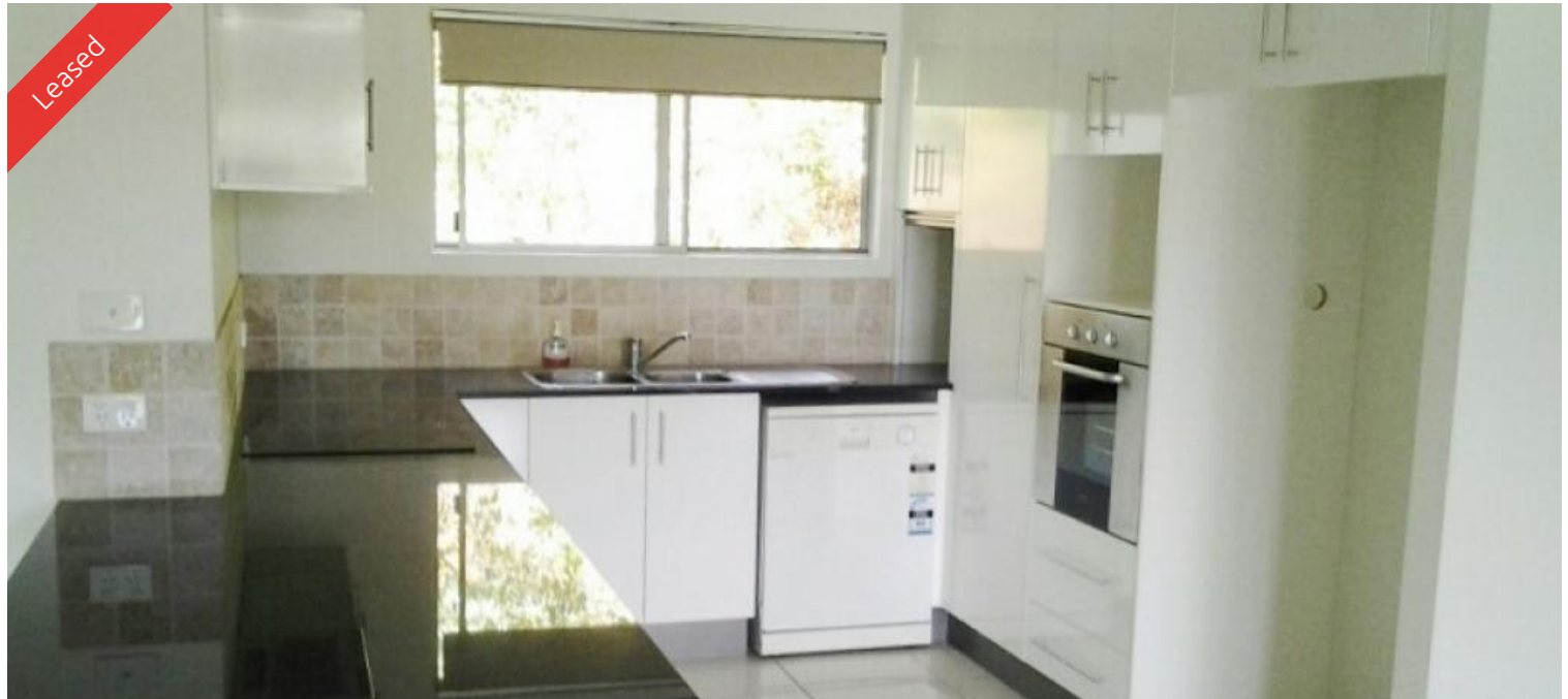
Unit 48, 3 Deloraine Cl, Cannonvale