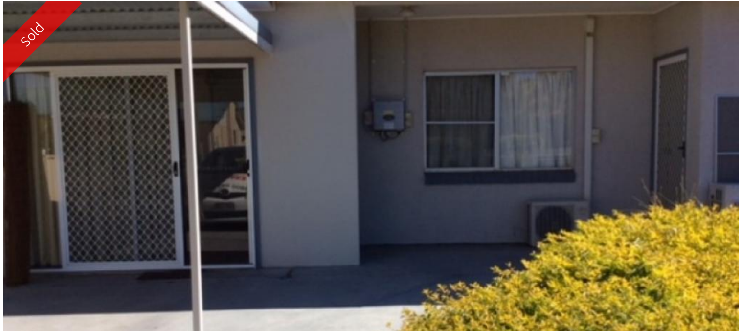
Unit 4, 6 Clark Dr, Emerald