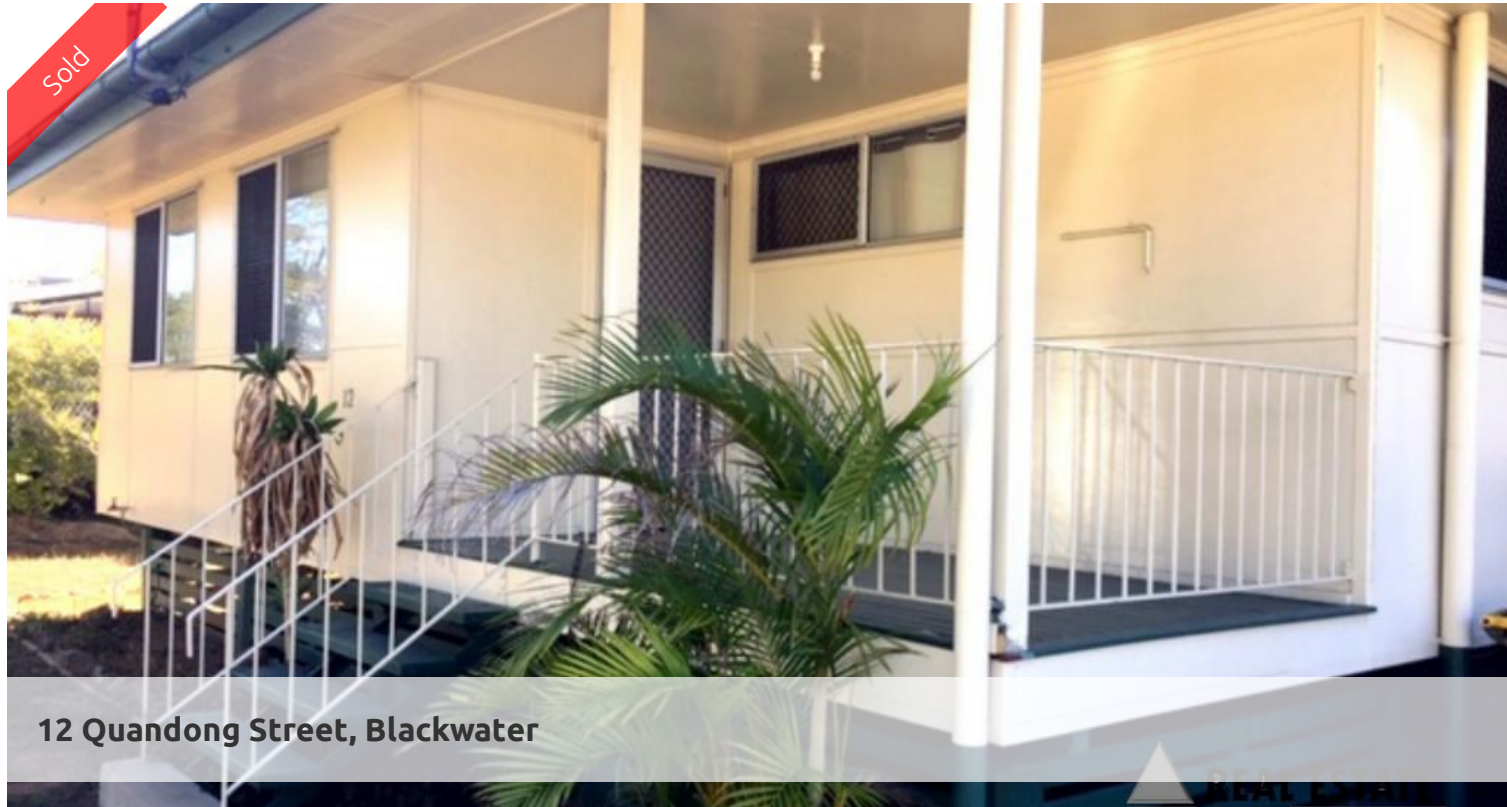
12 Quandong Street, Blackwater