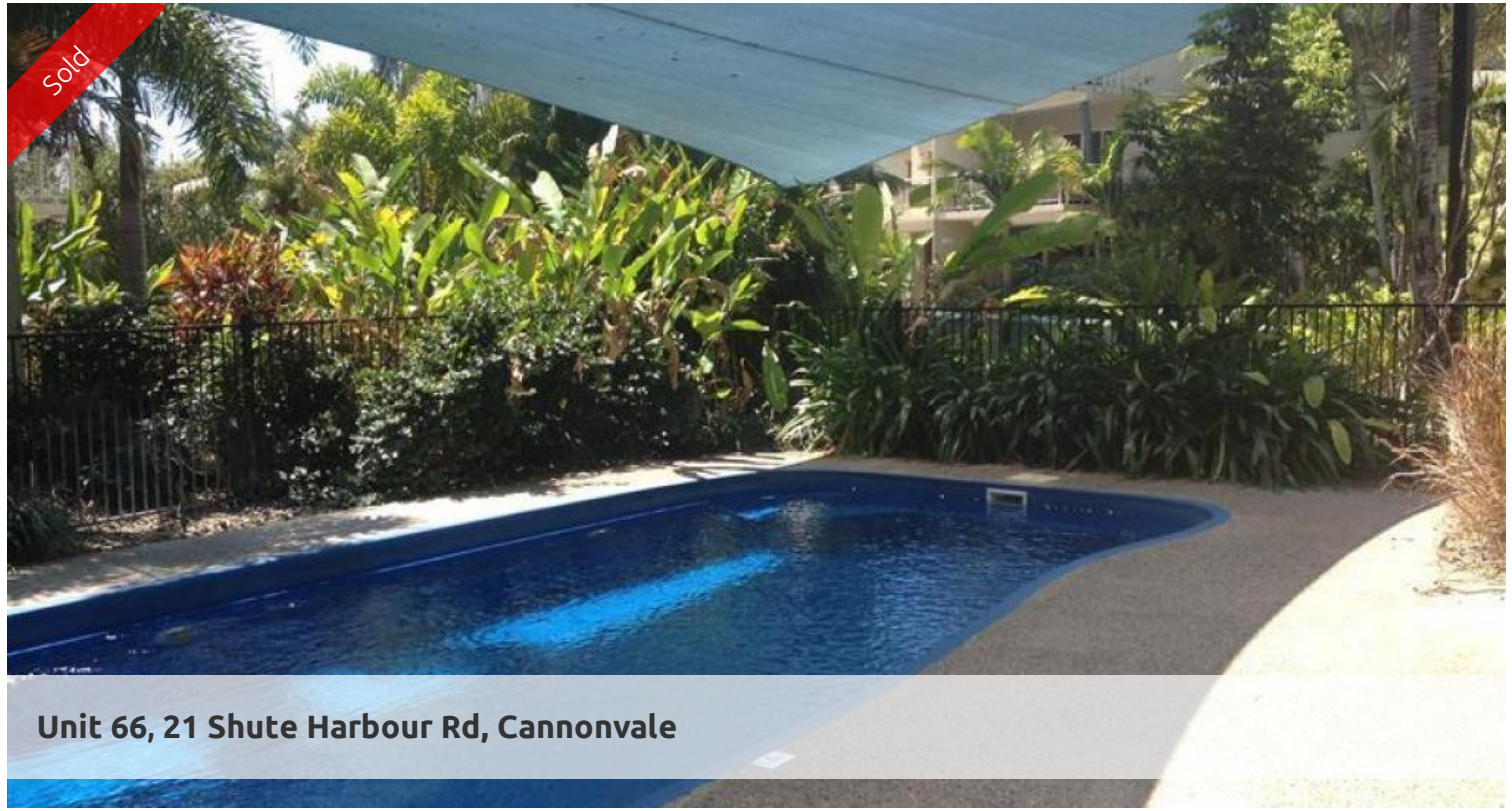
Unit 66, 21 Shute Harbour Rd, Cannonvale