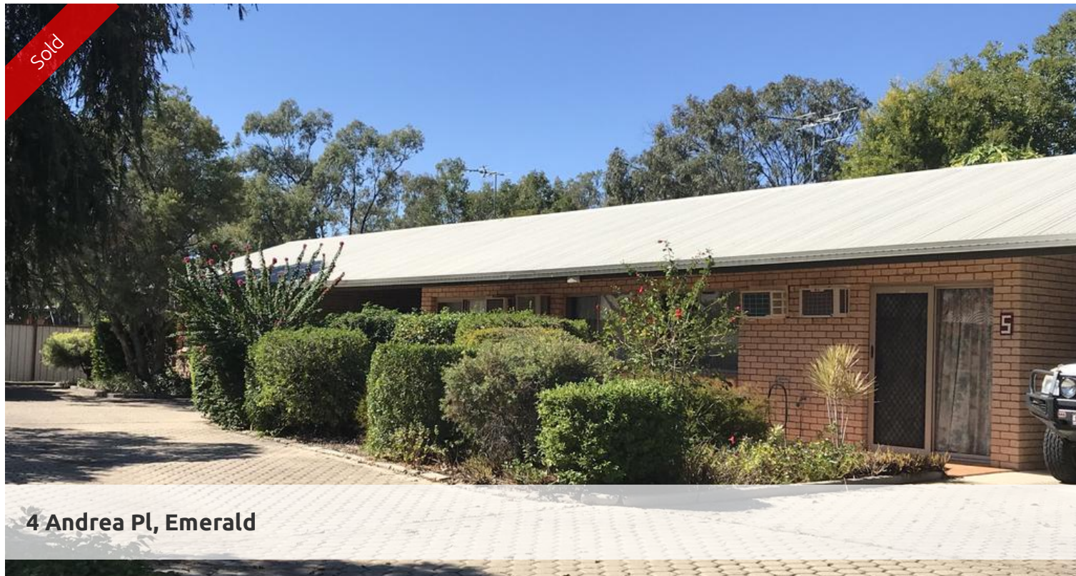
4 Andrea Pl, Emerald