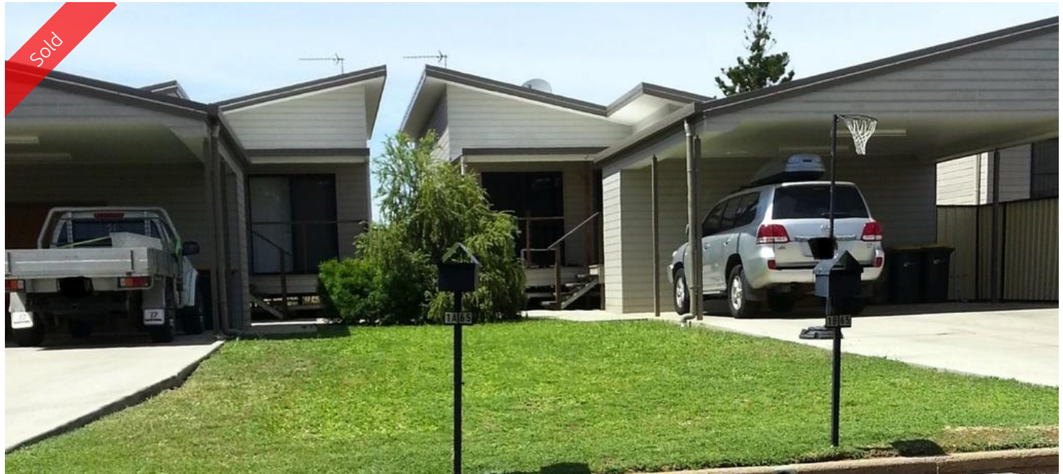
65 Stower Street, Blackwater