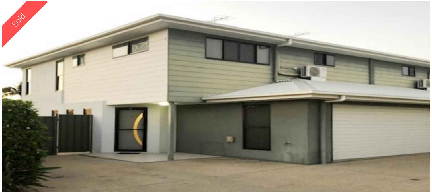
Unit 5, 41 Rufus Street, Blackwater